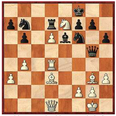
position was looking good. 1-0

the plan simple - push the pawn. 28...Rd8 29.Rd4 Centralization with tempo reduces Black's activity. 29...Qf5 30.Ne5 Again White goes with centralization to eliminate counterplay. 30...Nb7 31.d6 White should push before Black plays ...Nd6 and the plan of pushing the pawn is stopped. 31...Be6 32.Bb1 White has many ways to win so focuses on harassing the Black queen which seems exposed and short of squares. 32...Qg5 33.Nc6 Rd7 34.b4! Restricting Nb7 and beginning the process of taking away available squares from Black's queen. 34...Nd8 35.Ne7+ Kf8 36.Bd3! Taking away b5 and White has another follow-up in mind. 36...Nb7