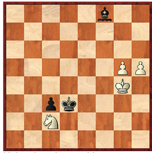
He's missed something