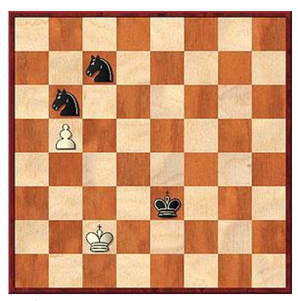
White to play

Let's take one step back from the first position analysed above. Here it is White's move, and he went immediately wrong with 54.Kc3? This of course led to his king being trapped in the corner.