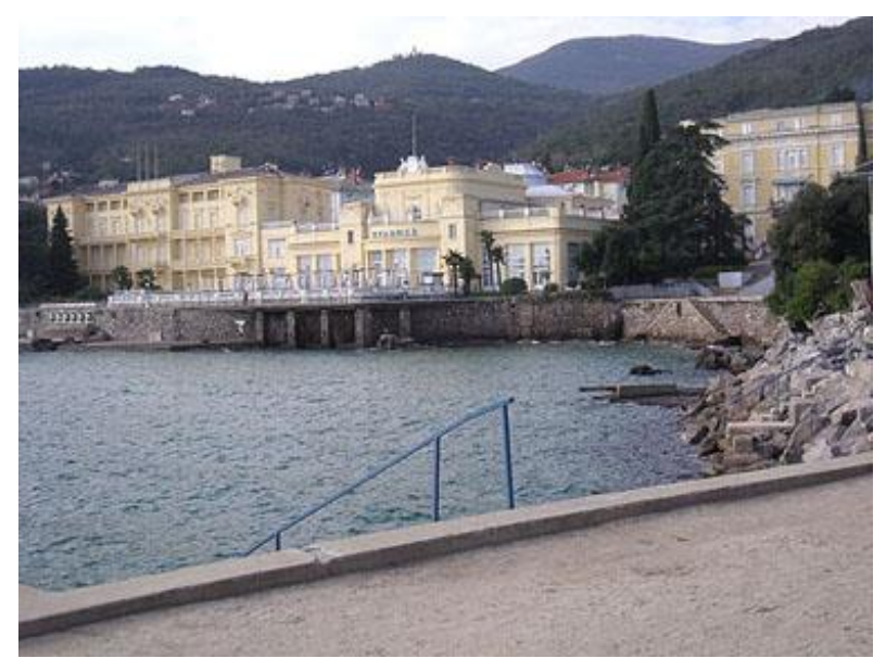
Hotel Kvarner – Site of 1912 gambit tournament

Opatija (formerly known by its Italian name - Abbazia) was a summer resort for the Austrian nobility in the nineteenth and twentieth centuries. The famous 1912 gambit tournament was held there at the Hotel Kvarner. I was told that they have a picture of the tournament on the wall there so I went to check it out. Unfortunately it was closed for renovations.