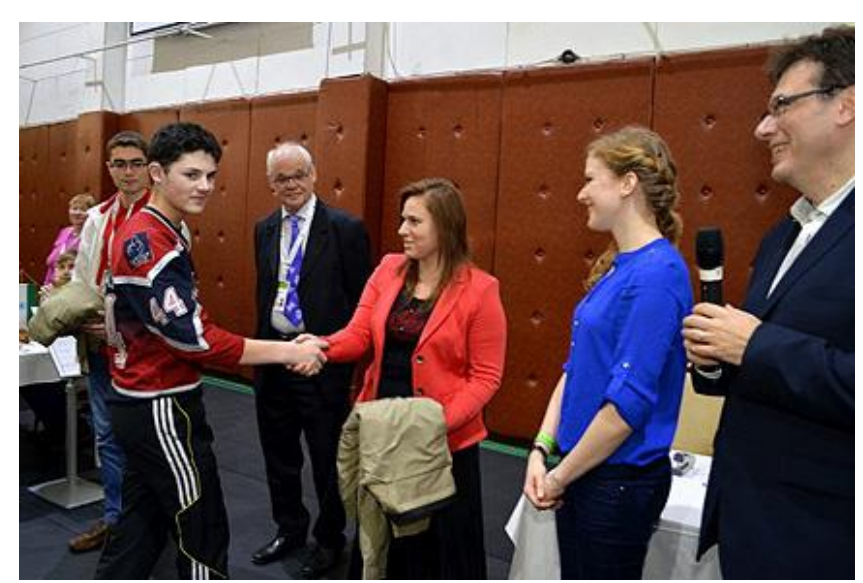
An inspirational player to receive an award from - Judit Polgar

1.e4 c5 2.Nf3 d6 3.d4 cxd4 4.Nxd4 Nf6 5.Nc3 a6 6.Bg5 Nbd7 7.f4 Qc7 8.Qe2 e6 9.0–0–0 b5 10.a3 Bb7 11.g4 Be7 12.Bg2 Rc8 13.Bxf6 Nxf6 14.g5 Nd7 15.h4 Qc4 16.Qe1 b4 17.Bf1 Qc5 18.Nb3 Qb6 19.axb4 Qxb4 20.Kb1 Nc5 21.Bb5+ axb5 22.Rd4 Qxd4 23.Nxd4 b4 24.Na2 Bxe4 25.Rh2 d5 26.Nxb4 0–0 27.Qd2 Ra8 28.Nd3 Ra4 29.Qe3 Rfa8 30.Kc1 Bxd3 31.Nc6 Bd6 32.cxd3 Bxf4 0–1