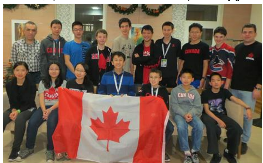
The Canadian players and coaches

The only previous U16 Olympiad to which Canada sent a team was Burdur (Turkey) in 2010. This year the event was held in Győr, Hungary and the CFC sent not one but three teams! Why exactly is unclear, apart from the fact that we have a particularly good crop of U16 players at the moment.