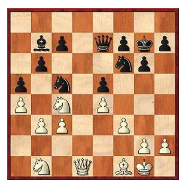
Do you see it?

Here is White's idea - to blunt Black's b7-bishop. But this involves putting another pawn on a light square, which inevitably weakens White's dark squares. But can such esoteric factors matter in a 3-minute game? 19...Rd7 (0:02:23) Black decides to simply double rooks on the open d-file. Principled play might be boring at times, but at least it's fast. 20.Nb1 (0:02:11) I was actually expecting this move - White seems intent on making the position as boring as possible by simplifying, trusting to the plan described in the note to move 15, above. 20...Red8 (0:02:21) 21.Rxd7 (0:02:10) 21...Rxd7 (0:02:20) 22.Rd1? (0:02:09) But this is a blunder - the position turns out to contain one of Lasker's drops of poison... 22...Rxd1 (0:02:14) 23.Qxd1 (0:02:09)