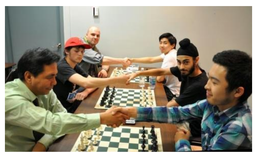
The beginning of the final round