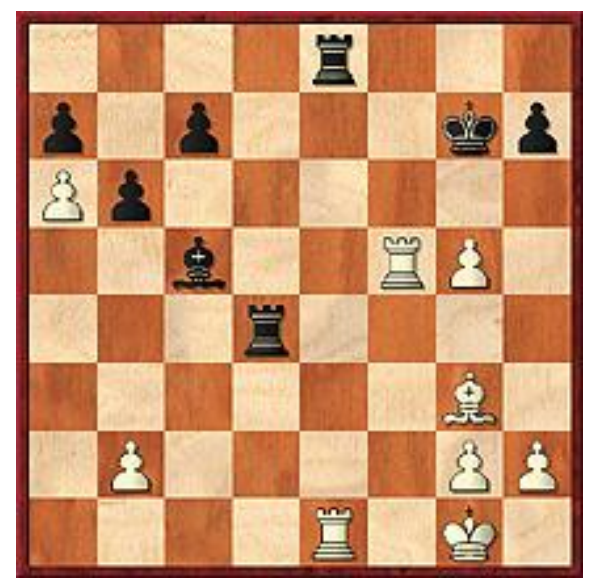
35.Rxc5! Of course not 35.Rxe8? Rd1#! 35...Rxe1+ 36.Bxe1 bxc5 37.Bc3 Neatly recovering the sacrificed material. 37...Kg6 38.Bxd4 cxd4 39.h4!