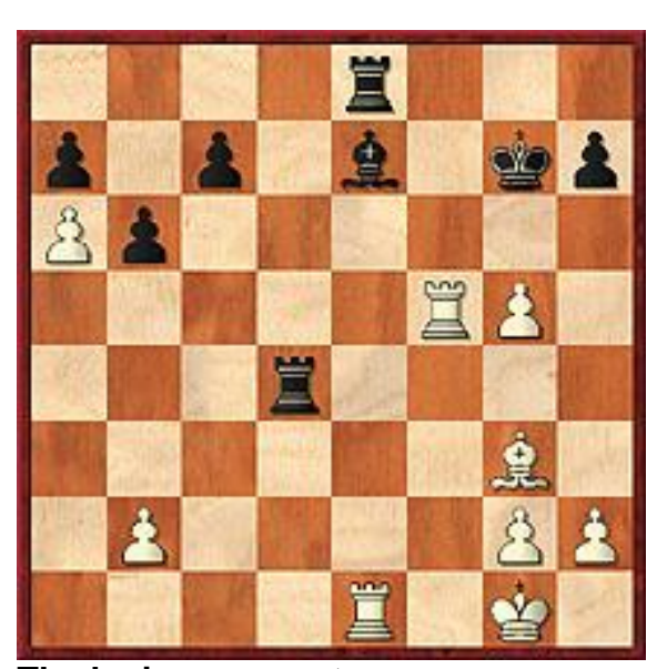
The losing moment