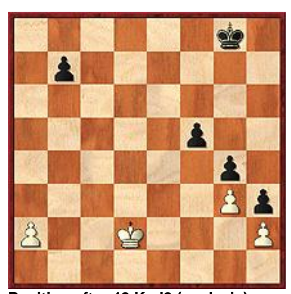
Position after 42.Kxd2 (analysis)

42...f4! 43.gxf4 Or 43.Ke2 fxg3 44.hxg3 h2, etc. 43...g3 44.hxg3 h2 The h-pawn will promote next move and White has no resources left.