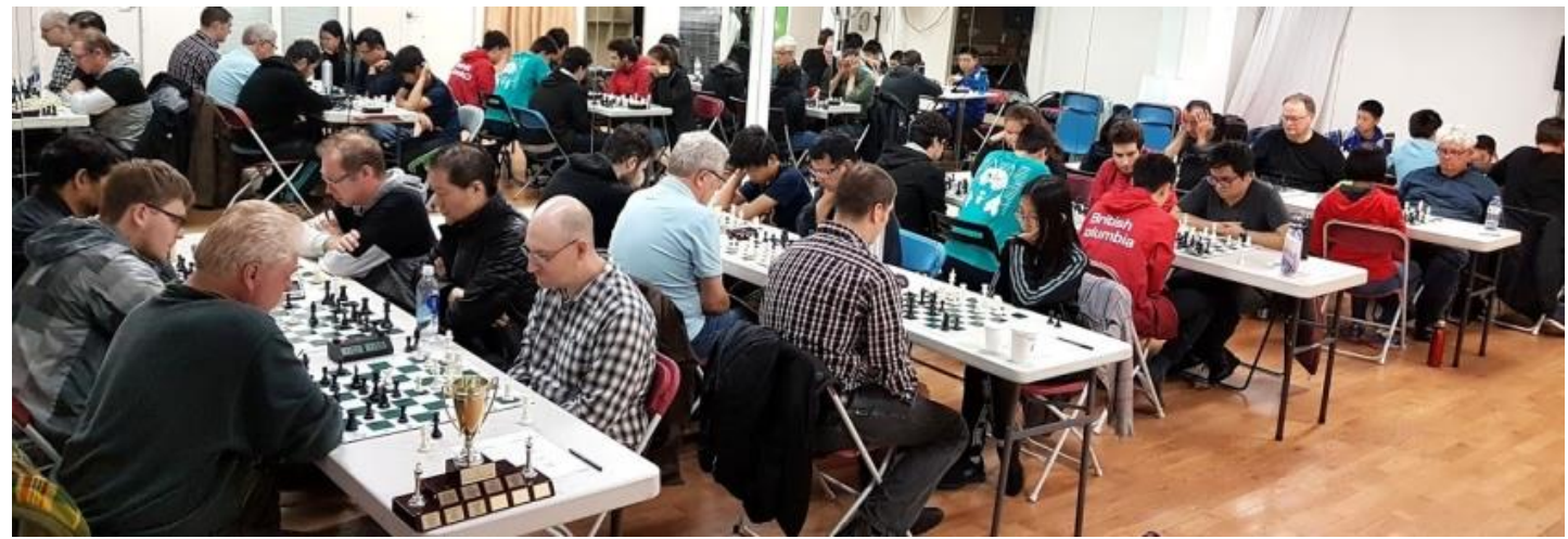
There are fewer players than there appear to be, the walls of the studio are mirrored ...

Vancouver Rapid Chess League (September 22)