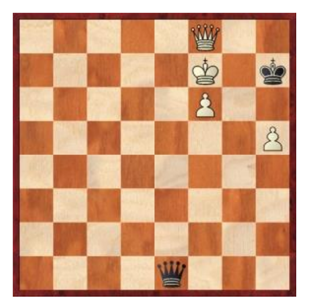
15...Qe6+! 16.Kxe6 and Black is stalemated!

After White's move 8.exf5, Black could still have drawn the game in study-like fashion: 8...Kg8! (instead of 8...e4) 9.f6 g4! (again, not 9...e4? because of 10.fxe4 g4 11.e5 g3 12.e6 g2 13.exf7+ Kh7 14.f8Q g1Q 15.Qf7+ Kh8 16.Qe8+ Kh7 17.Qg6+ Qxg6 18.hxg6+ Kxg6 19.f7 and wins) 10.fxg4 e4 11.g5 e3 12.g6 e2 13.gxf7+ Kh7 14.f8Q e1Q+ 15.Kf7