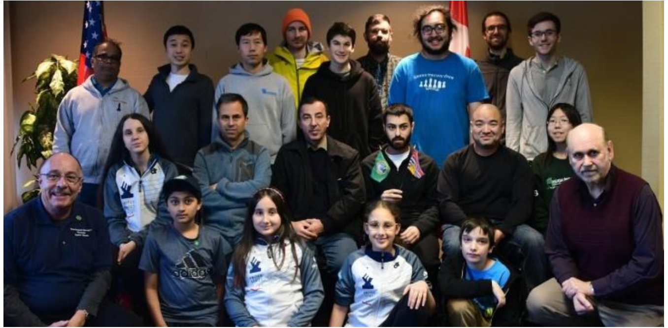
2019 BC vs WA match group photo. BC carried the match 26-24 after losing in the first two years of this annual challenge match.

Washington has accepted the challenge for the fourth annual BC vs WA match, to be held at the Comfort Inn Hotel and Suites in Victoria on the weekend of 17-19 January, 2020. The match will be FIDE rated and will return 200% of entries in prizes. Accommodation at the Comfort Inn $109/night including hot breakfast and free parking. Invitations will be sent out shortly. Further details can be found on the BCCF website. For inquiries contact Paul Leblanc at <u>pc-leblanc@shaw.ca</u>