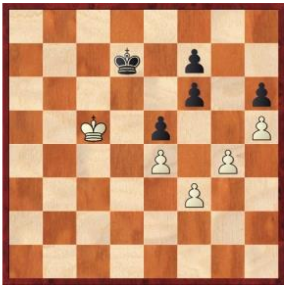
L. Volpert - T. Zatulovskaya USSR Team Ch 1960, Black to play

White stands better. Her king is more active, and her opponent's pawn structure has been compromised. It remains to be seen if these factors can be turned into a win. 1...Ke7! The alternative 1...Kc7? maintains the opposition but allows White to break through after 2.g5! fxg5 3.Kd5 Kd7 4.Kxe5 Ke7 5.Kf5 Ke8 6.Kf6 Kf8 7.e5 Kg8 8.Ke7 Kg7 9.e6 fxe6 10.Kxe6 Kg8 11.Kf6 Kh7 12.Kf7 Kh8 13.Kg6 and wins. 2.Kd5 Kf8 3.Kc6! "At first glance this move seems strange, but there is a definite idea behind it" (Bondarevsky). White is playing for the "distant opposition," but Black is alert to the danger. The immediate 3.g5 hxg5 4.Kd6 gets nowhere after 4...f5 5.Kxe5 fxe4 6.Kxe4 Kg7 7.Kf5 Kh6 8.Kg4 (8.Kf6 Kxh5 9.Kxf7 g4 10.fxg4+ Kxg4=) 8...f5+ 9.Kxf5 Kxh5 and draws. 3...Kg7! Not 3...Ke8? 4.Kd6 Kf8 (4...Kd8 5.g5+-) 5.Kd7 Kg8 (5...Kg7 6.Ke7+-) 6.Ke8 and White wins; or 3...Ke7? 4.Kc7 Ke8 5.Kd6 Kf8 6.Kd7 and Black can safely resign. 4.Kc7 Kh7 5.Kd7 Kh8! Again the only move. Black maintains the distant opposition and is ready to meet Ke7 with ...Kg7, and Ke8 with ...Kg8. But with Black's king on h8, White can now execute the breakthrough idea.