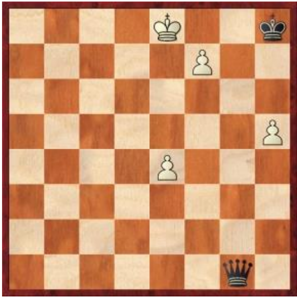
Black to play, White wins

Black is at a crossroads. She must try for counterplay by sacrificing one of her pawns to obtain her own passed pawn. But how to carry this out? 8...e4!? First we will see how the game ended, and then come back to this position. 9.fxe4 g4 10.Kxf7 g3 11.f6 g2 12.Ke8 g1Q 13.f7!