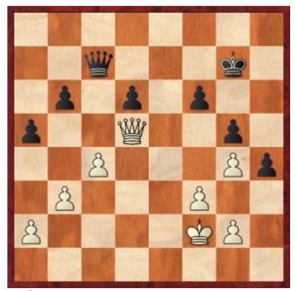
J. Street - M. Parpatt New Westminster Fall Open 2019 Black to play

Endgames are difficult enough to play at normal time controls, but when both players are on increments the difficulties are multiplied. I hesitated about including the next position in this column, but in the end decided there was something valuable to be learned from the three critical moments that came up during play. The final position is also instructive.