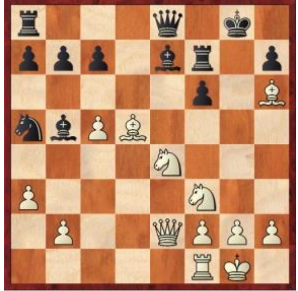
Pribyl-Stulik, CSSR 1968

The following game is not in ChessBase, so will begin from the diagram.