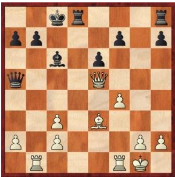
R.Matokhin - G.Khodos, Volgograd Oblast Ch 1969 Black to play

This classic line from the 2017 film The Death of Stalin is a fitting introduction to yet another assault on published analysis. Our source today is the Combination section of Informant 7 .