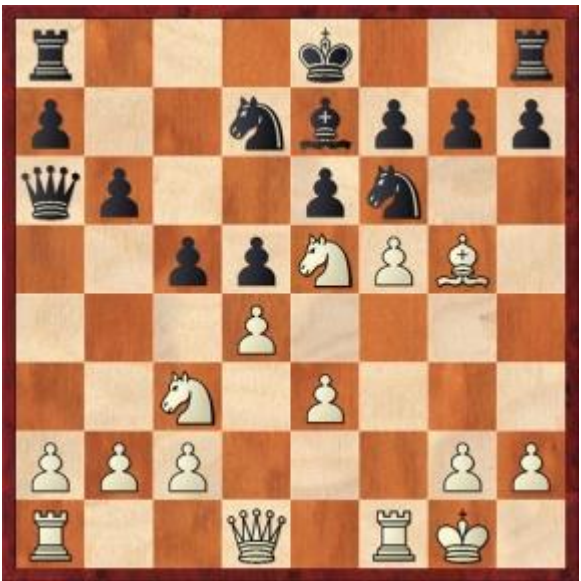
Balendo – Shcherbitsky, Minsk Ch 1969 White to play

b) More promising is 5.Nd4 Qc8 6.Qxg5+ Kf7 7.Qh5+ Kf6 8.Kxf1 but after 8...Nc6! Black's defences seem to hold; for example, 9.Qg5+ Kf7 10.Qg7+ Ke8 11.Qg8+ Kd7 12.Qd5+ Ke8 13.Ne6 Bf6 (13...Nd8!? may also be sufficient) 14.Bf4 Ne7 15.Nxc7+ Kf8 16.Qe4 Kg7 17.Nxa8 Qxa8 and a draw is the likely outcome.